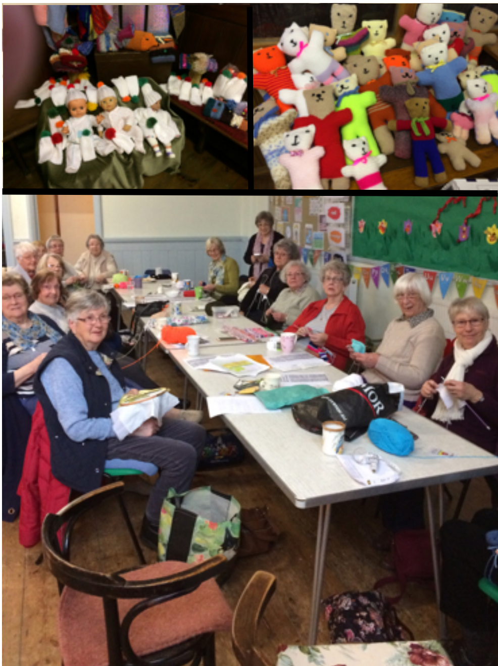
Oreston Stitch, Knit and Natter group as described in various newspaper articles reproduced on page 26.