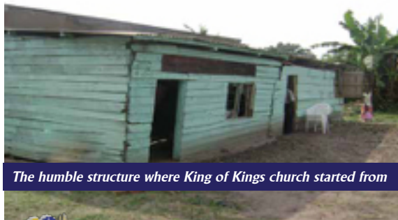
The humble structure where King of Kings church started from

In December 2007 we began holding prayer meetings two or three times a week in the only